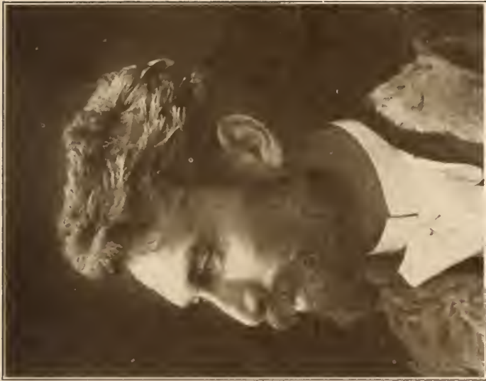
A JEW OF THE FINER TYPE

A Russian Jew; cultured, artistic and cosmopolitan.